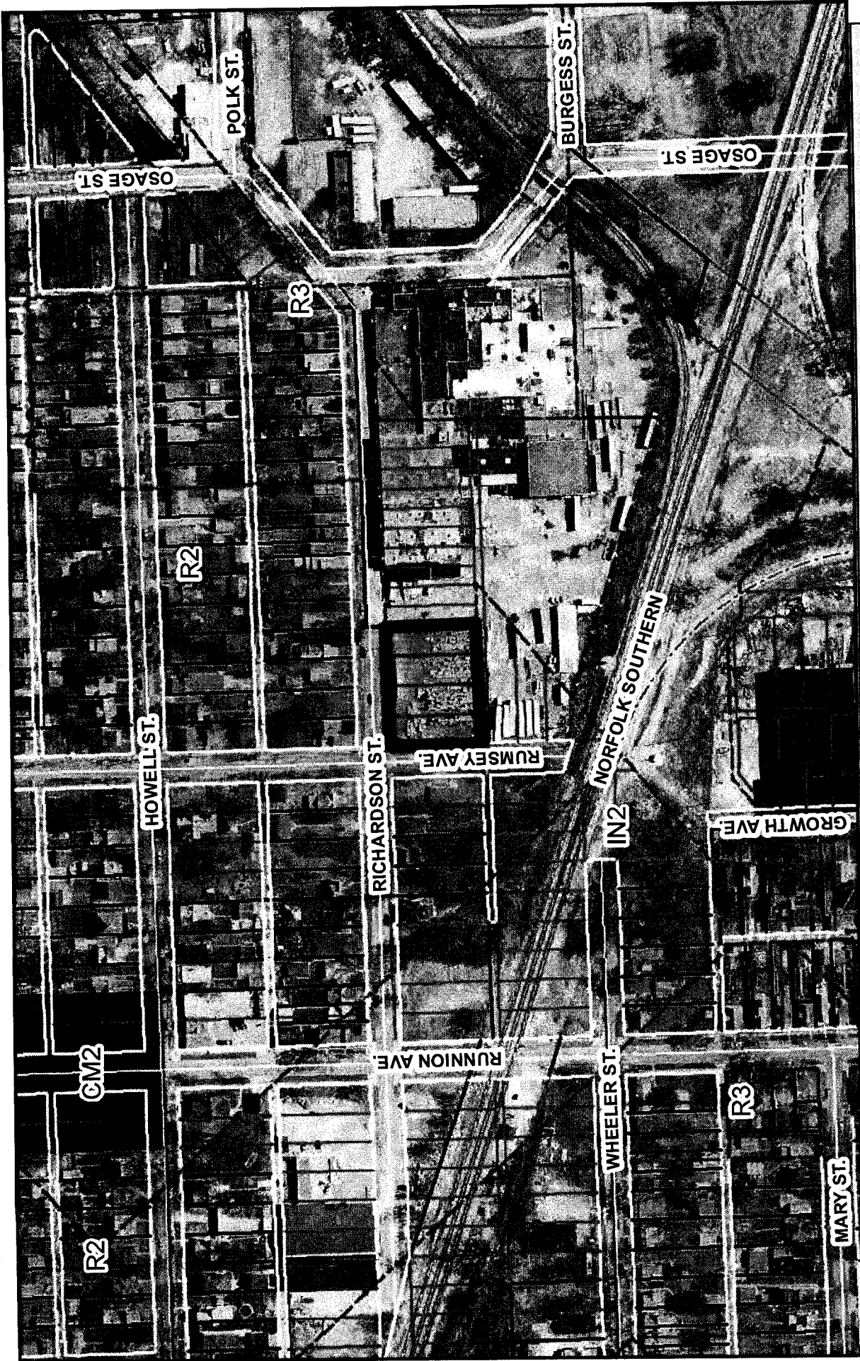
This map is for representational purposes only - Boundaries identified by bold colored lines represent the general location of the proposed project